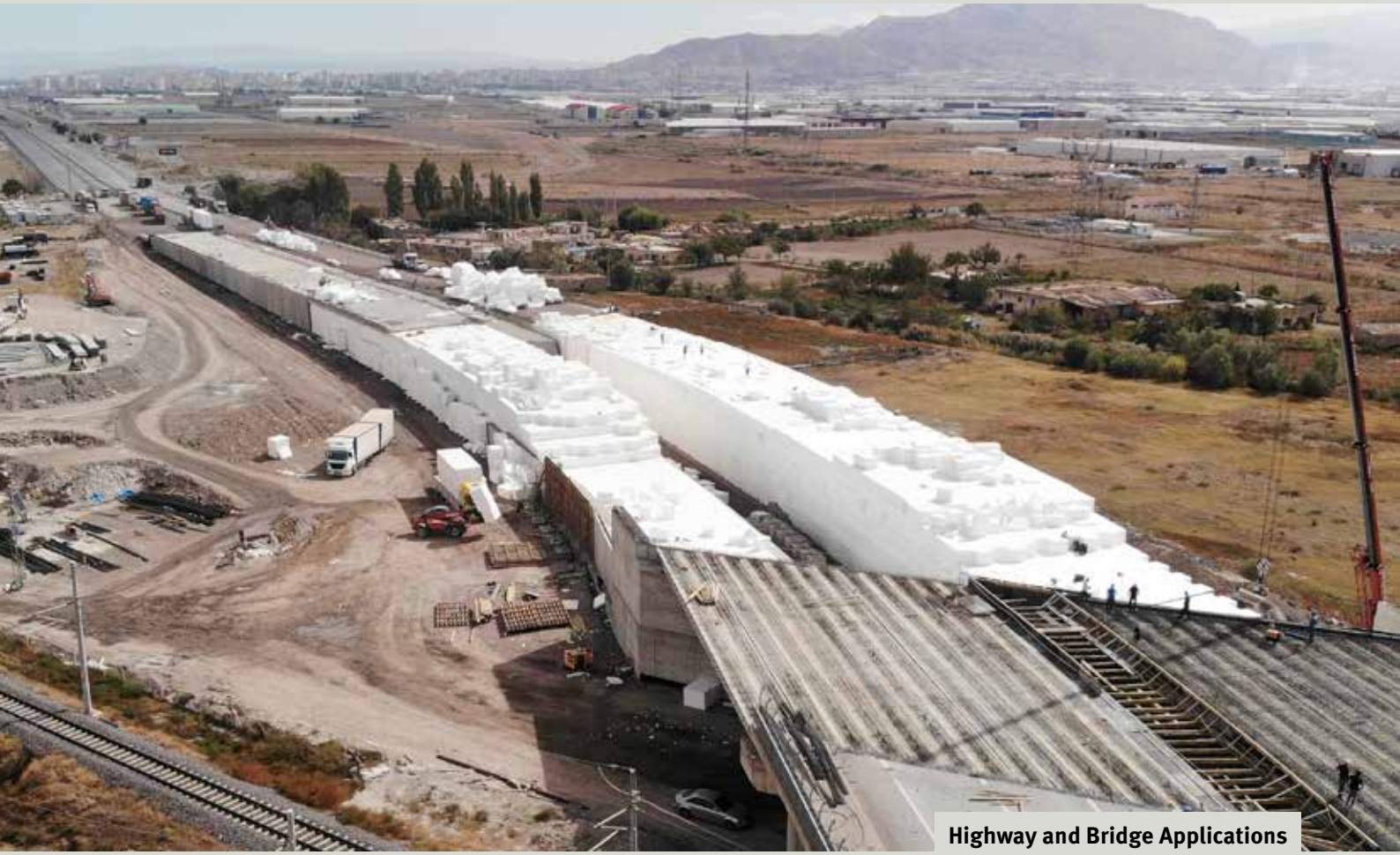
Highway and Bridge Applications